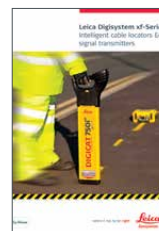
Leica Digisystem xf-Series Brochure