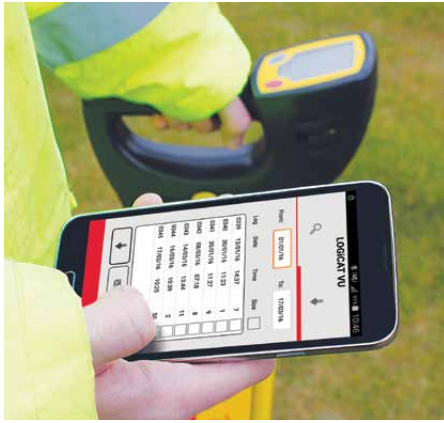
Download and transfer data in the field