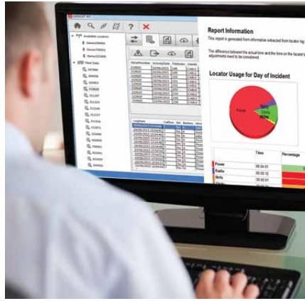
Analyse your fleet centrally