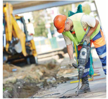
Reduce utility strikes and keep your staff safe