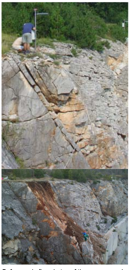
Before and after photos of the area around monitoring point 2.

The detection of this movement validated the mine operator's decision to invest in a complete Leica Monitoring solution. The safety of the workers and mining equipment was ensured and there were considerable cost savings. A one off investigation into the rock face would cost at least 20% of the initial set up cost of the complete monitoring system. The complete system on the other hand monitors three points continuously, it will operate for many years to come and will provide a long term history of all movements at the quarry. Classical geological monitoring also causes damage to healthy rock, which can result in more problems in the long term.