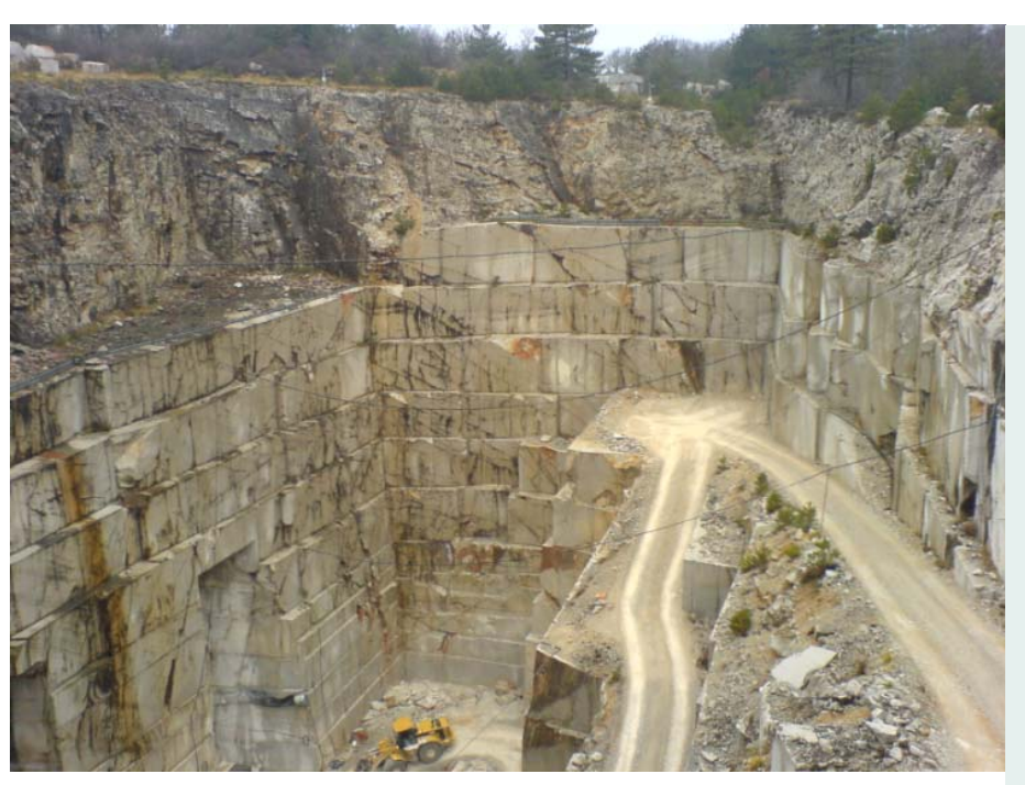
Lipica II quarry. The underground entrance is 60 m below the surface.

During September 2008 the first monitoring project in Slovenia was initiated. The projects success was due to the joint cooperation of the University of Ljubljana, Faculty of Natural Sciences and Engineering (Slovenia), Geoservis and Marmor Sežana.