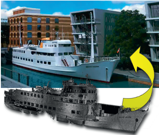
This photorealistic image was created by first modeling the boat from a point cloud as shown.*