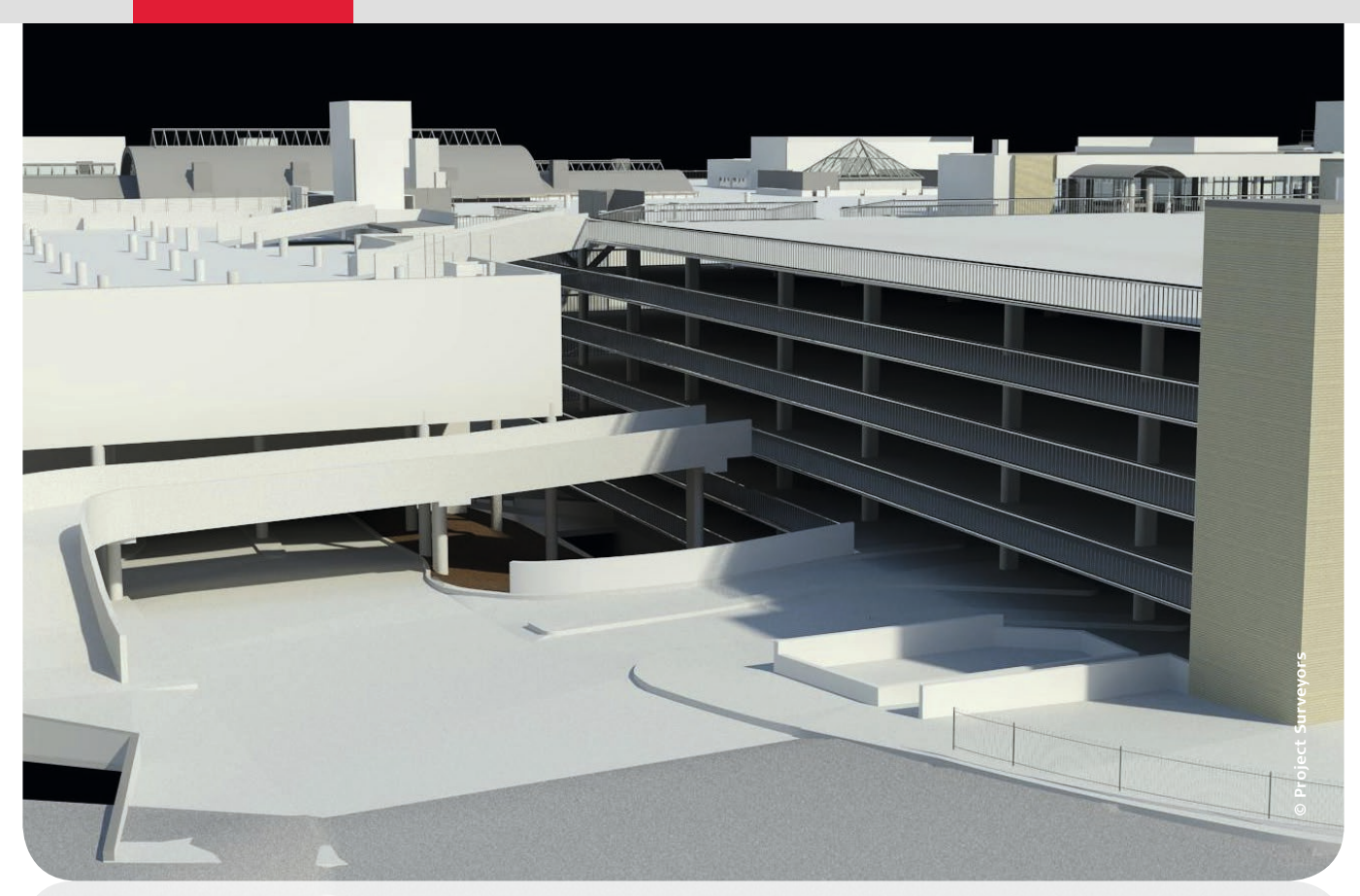
Australia's second largest shopping centre has been digitally preserved for redevelopment.

Autodesk Revit 2014 was used to model architectural elements while Autodesk Revit Mechanical, Electrical, Piping (MEP) was used to create pipes, plant, ducts and other services to create a partial MEP model of the loading docks. As the size and detail of this project would have taken one modeller 120 days to complete, Project Surveyors worked with a team of modellers in collaboration on one central model across a wired and large-data network.