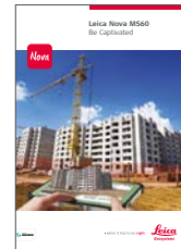
Leica Nova MS60