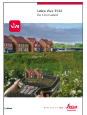
Leica Viva TS16