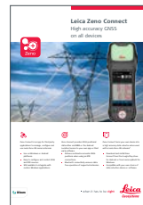
Leica Zeno Connect