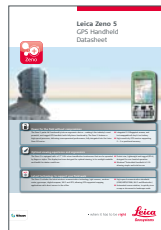
Leica Zeno 5

Microsoft, Windows® and the Windows logo are either registered trademarks or trademarks of Microsoft Corporation in the United States and / or other countries.