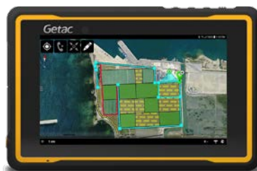
ZENO TAB 1