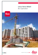
Leica Nova MS60

Illustrations, descriptions and technical data are not binding. All rights reserved. Printed in Switzerland – Copyright Leica Geosystems AG, Heerbrugg, Switzerland, 2019. 836338en – 11.19 – INT