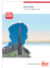
Leica Viva Overview brochure

Illustrations, descriptions and technical data are not binding. All rights reserved. Printed in Switzerland – Copyright Leica Geosystems AG, Heerbrugg, Switzerland, 2009. 774267en – VI.13 – galledia