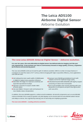
Leica ADS100 Airborne Digital Sensor Airborne Evolution