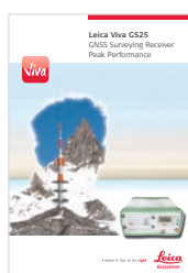
Leica Viva GS25 GNSS Surveying Receiver Peak Performance

Illustrations, descriptions and technical specifications are not binding and may change. Printed in Switzerland – Copyright Leica Geosystems AG, Heerbrugg, Switzerland, 2014. 821033en - 05.14 - galledia