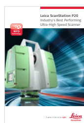
Leica ScanStation P20 Industry's Best Performing Ultra-High Speed Scanner