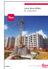
Leica Nova MS60