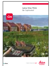
Leica Viva TS16