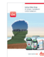
Leica Viva Uno Product brochure

Leica Geosystems AG Heerbrugg, Switzerland www.leica-geosystems.com