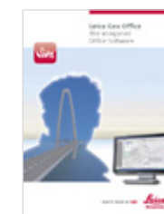
Leica Viva LGO Product brochure