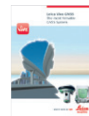
Leica Viva GNSS Product brochure