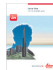
Leica Viva Overview brochure

Illustrations, descriptions and technical data are not binding. All rights reserved. Printed in Switzerland – Copyright Leica Geosystems AG, Heerbrugg, Switzerland, 2011. 792398en – VI.13 – galledia