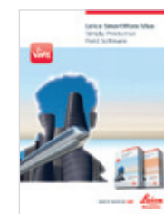
Leica SmartWorx Viva Product brochure