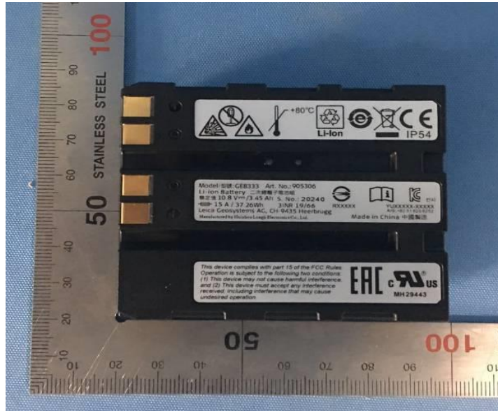
电池图片 Battery picture