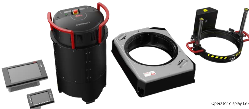
Leica CityMapper-2 with peripherals: Operator display Leica OC60, pilot display Leica PD60, gyro-stabilised sensor mount Leica PAV100 and Leica Pod Lifter.