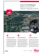
Leica TerrainMapper Highest accuracy for regional mapping projects

Leica Geosystems AG leica-geosystems.com