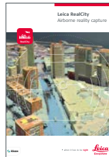
Leica RealCity Airborne reality capture

Illustrations, descriptions and technical data are not binding. All rights reserved. Printed in Switzerland – Copyright Leica Geosystems AG, Heerbrugg, Switzerland, 2019. 900980en – 09.19