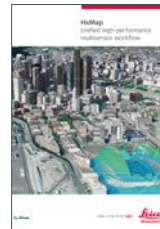
Leica HxMap Unified high-performance multisensor workflow