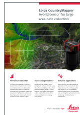
Leica CountryMapper Hybrid sensor for large-area imaging and LiDAR data collection

Illustrations, descriptions and technical data are not binding. All rights reserved. Printed in Switzerland – Copyright Leica Geosystems AG, Heerbrugg, Switzerland, 2023. 900980en – 11.23