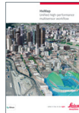
Leica HxMap Unified high-performance multisensor workflow