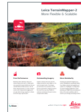
Leica TerrainMapper-2 Highest accuracy for regional mapping projects

Leica Geosystems AG leica-geosystems.com