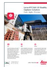
Leica RTC360 Data Sheet