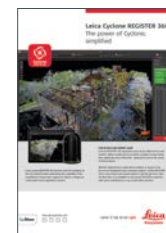
Leica Cyclone REGISTER 360 Data Sheet