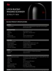
Leica BLK360 Data Sheet

All specifications are subject to change without notice.