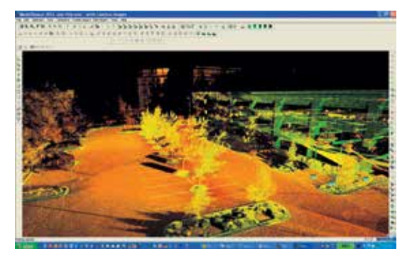
Direct importing of data in native format from third-party scanners provides greater office efficiency and versatility for Cyclone and CloudWorx users who need to work with such data.