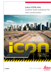
Leica iCON site Brochure