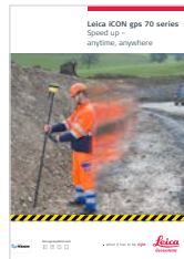
Leica iCON gps 70 Series Brochure

Illustrations, descriptions and technical data are not binding. All rights reserved. Printed in Switzerland – Copyright Leica Geosystems AG, Heerbrugg, Switzerland, 2020. 818196en – 01.21