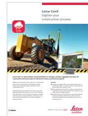
Leica ConX Flyer