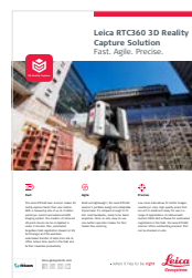
Leica RTC360 3D Reality Capture Solution

Active Customer care is a true partnership between Leica Geosystems and its customers. Customer Care Packages (CCPs) ensure optimally maintained equipment and the most up-to-date software to deliver the best results for your business. The myWorld@Leica Geosystems customer portal provides a wealth of information 24/7.