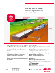
Leica Cyclone MODEL

Leica Geosystems AG Heinrich-Wild-Strasse 9435 Heerbrugg, Switzerland +41 71 727 31 31