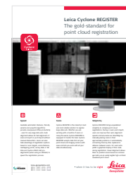
Leica Cyclone REGISTER