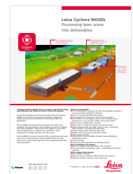
Leica Cyclone MODEL

Leica Geosystems AG Heinrich-Wild-Strasse 9435 Heerbrugg, Switzerland +41 71 727 31 31