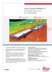
Leica Cyclone MODEL