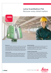
Leica ScanStation P16

Illustrations, descriptions and technical specifications are not binding. All rights reserved. Printed in Switzerland – Copyright Leica Geosystems AG, Heerbrugg, Switzerland 2016. 839696en – 03.17