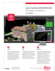
Leica Cyclone REGISTER 360