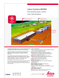
Leica Cyclone MODEL

Leica Geosystems AG Heinrich-Wild-Strasse 9435 Heerbrugg, Switzerland +41 71 727 31 31