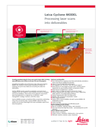
Leica Cyclone MODEL

Leica Geosystems AG Heinrich-Wild-Strasse 9435 Heerbrugg, Switzerland +41 71 727 31 31