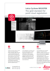
Leica Cyclone REGISTER