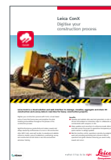
Leica ConX flyer

Leica Geosystems AG Heinrich-Wild-Strasse 9435 Heerbrugg, Switzerland +41 71 727 31 31