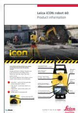
Leica iCON robot 60 datasheet

Copyright Leica Geosystems AG, 9435 Heerbrugg, Switzerland. All rights reserved. Printed in Switzerland – 2018. Leica Geosystems AG is part of Hexagon AB. 870464en – 01.18