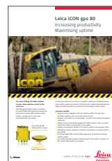
Leica iCON gps 80 datasheet