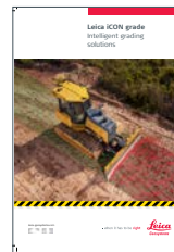
Leica iCON grade brochure