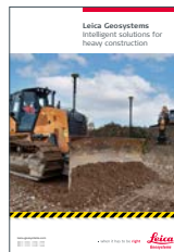
Intelligent solutions brochure

Copyright Leica Geosystems AG, 9435 Heerbrugg, Switzerland. All rights reserved. Printed in Switzerland – 2023. Leica Geosystems AG is part of Hexagon AB. 808670en – 09.23