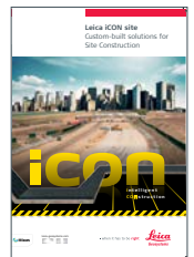
Leica iCON site brochure

Leica Geosystems AG Heinrich-Wild-Strasse 9435 Heerbrugg, Switzerland +41 71 727 31 31