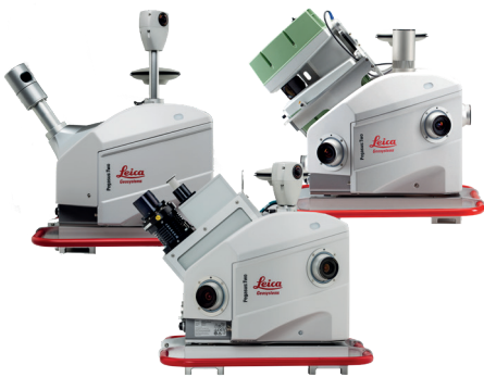
Pegasus:Swift, Pegasus:Two & Pegasus:Two Ultimate

The relationship Leica Geosystems enjoys with its customers can be defined in one word: Partnership. That is our commitment to you, true partnership that includes a full circle of Active Customer Care support and services around the globe, anytime and anywhere. Our job as your reliable partner is to cover all the angles, to provide quick and easy communication between site personnel and skilled experts, to keep you and your products up-to-date, to understand the issues and anticipate your needs. Leica Geosystems Active Customer Care is one of the most comprehensive service and support networks in the world. It allows us to stay close to our customers, working together to resolve issues and plan even better product solutions for the future. It is our commitment to your success.