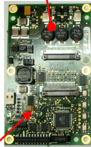
Printed Circuit Board