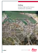
HxMap Unified high-performance processing workflow

Copyright Leica Geosystems AG, 9435 Heerbrugg, Switzerland. All rights reserved. Printed in Switzerland – 2017. Leica Geosystems AG is part of Hexagon AB. 865888en – 09.17