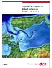
Airborne Bathymetric LiDAR Solutions Proven productivity