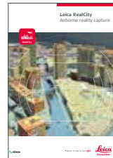
Leica RealCity Airborne reality capture