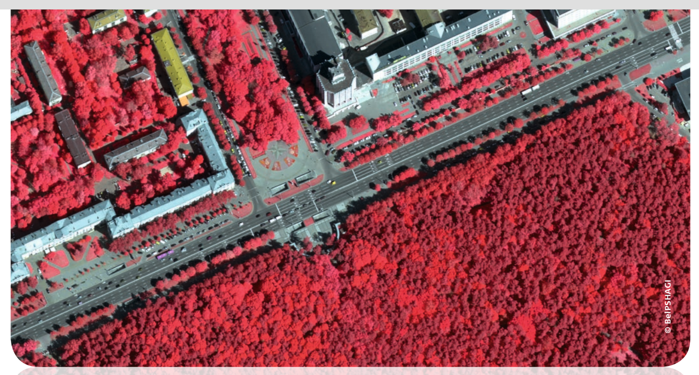
Multispectral image taken over Minsk helping to assess forest health.

and makes it possible to tackle issues concerning thematic processing of remote sensing and geoinformation analysis. Up-to-date methods of decoding and analysis of aerial surveys enabled BelPSHAGI to achieve its goals, regardless of the degree of complexity or spatial and time conditions.