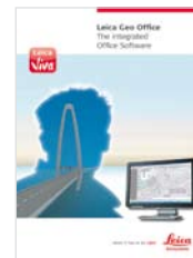
Leica Viva LGO Product brochure