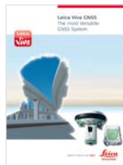
Leica Viva GNSS Product brochure