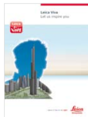
Leica Viva Overview brochure

Other trademarks and trade names are those of their respective owners.