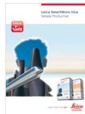
Leica SmartWorx Viva Product brochure