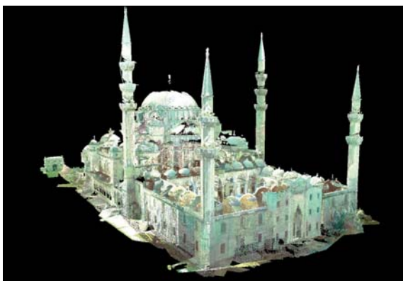
■ Scanning the Süleymaniye Mosque required a long-range, high-accuracy Leica Geosystems laser scanner.

For cultural landmarks, BIMTAŞ turned to Leica Geosystems' versatile, high accuracy time-of-flight scanner (HDS3000). Although not as fast as phase-based scanners, this scanner was needed to achieve high-accuracy (6 mm), high-density (5–10 mm spacing) scan data at long ranges. The Süleymaniye mosque, for example, features a 76 m minaret and 55 m dome.