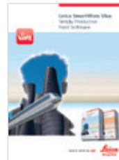
Leica SmartWorx Viva Product brochure