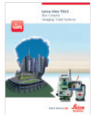
Leica Viva TS15 Product brochure