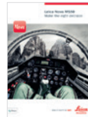
Leica Nova MS50 Product brochure