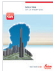
Leica Viva Overview brochure

Illustrations, descriptions and technical data are not binding. All rights reserved. Printed in Switzerland – Copyright Leica Geosystems AG, Heerbrugg, Switzerland, 2010. 783019en – 07.14 – galledia