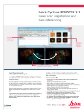
Leica Cyclone REGISTER